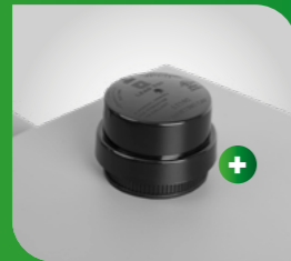
Compatible with modern control systems (through the use of additional NEMA and ZHAGA connectors)