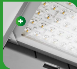
Diffuser made of tempered glass, and effective matrices lenticular protection.