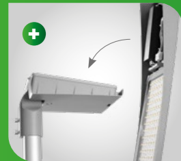
Quick, innovative assembly saves Installer's operational time.