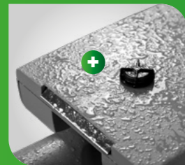
Uniform body structure housing minimizes risk of loss high IP66 protection.